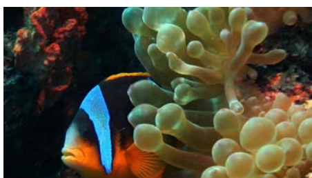
MWANYANZA 1.8KM LONG CORAL REEF