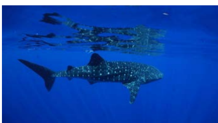
KINONDO WHALE SHARK SPOT