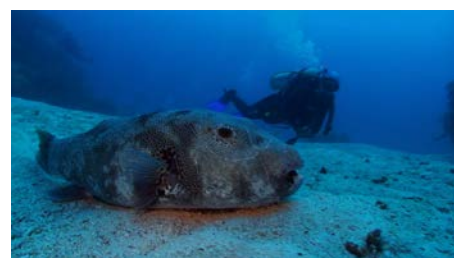
Mwanamoshi LONGEST REEF AROUND DIANI